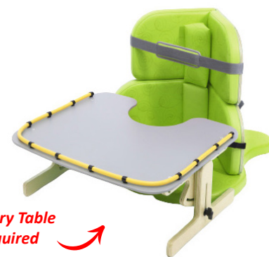
Nursery Table Required