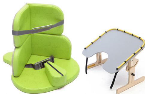
Available in Green