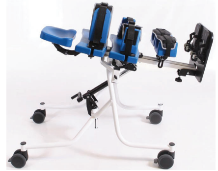
Multistander size 2 Configurations for representation only