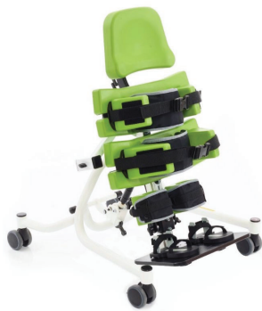
Multistander size 1

A simple to use, yet comprehensive standing system providing prone and upright positioning . Abduction configuration option available on the size 1 model.