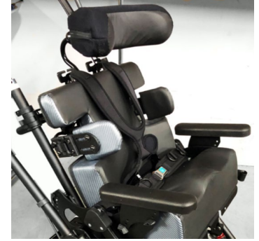
Seating pictured above is for illustration purposes only. Dealer to supply aftermarket.