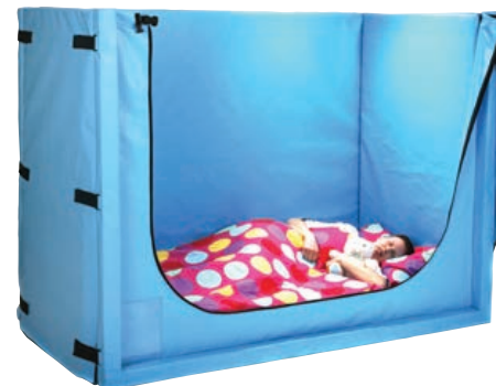
Each Safespace Cosyfit is custom fabricated. The image above is an example of multiple custom selections.