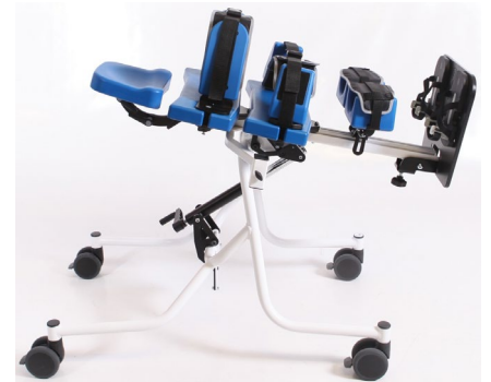
Multistander size 2