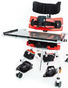
Multistander with Abduction