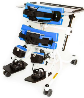
Multistander with Abduction