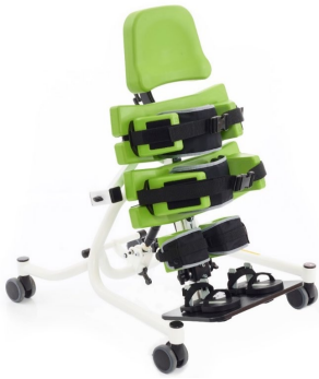
Multistander size 1

A simple to use, yet comprehensive standing system providing supine, prone and upright positioning with the additional option of abduction configuration on the size 1 model.