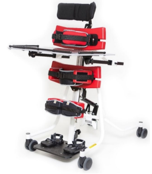
Multistander size 2