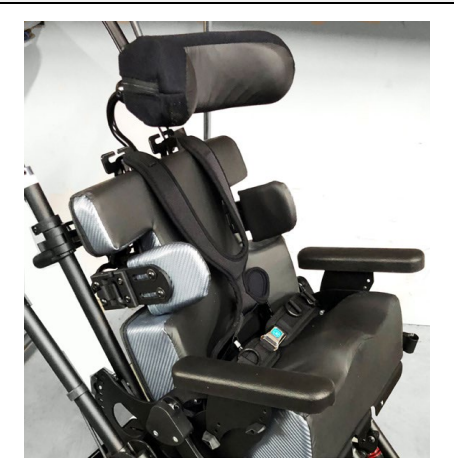
Configurations for representation only. Seat and Back Cushion purchased by dealer from Separate manufacturer