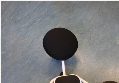
Cover for floating disc