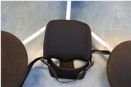
Upholstry (extra cover for board)