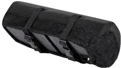
Head support with cover