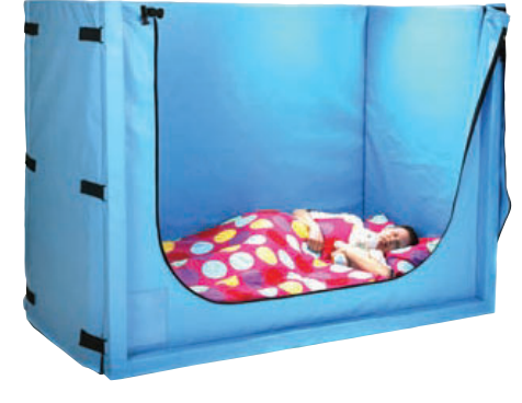
Each Safespace Cosyfit is custom fabricated. The image above is an example of multiple custom selections.