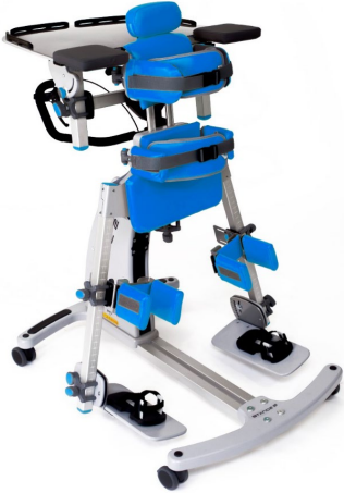
Configuration for representation only

A versatile standing system offering prone or supine standing that accommodates abducted or neutral leg positioning for children between 5 - 14 years