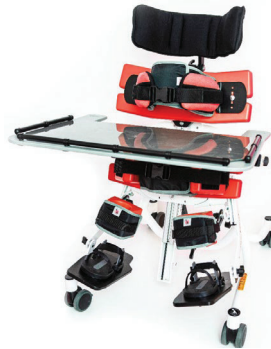
Multistander 1 with Abduction Size 1 Only