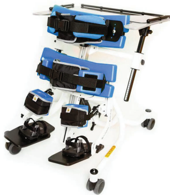
Multistander with Abduction Size 1 Only