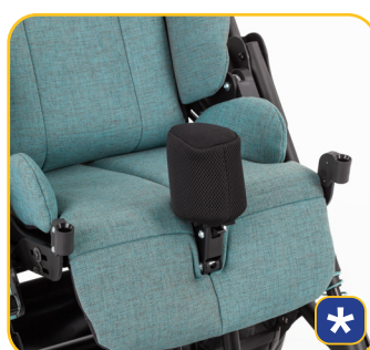
Removable Abduction Block