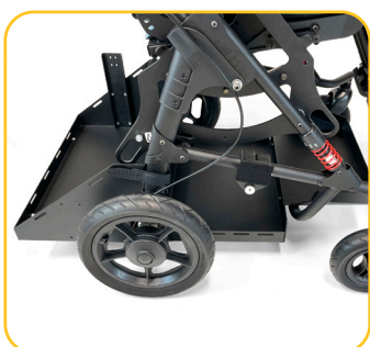
3 Piece Removable Vent Tray