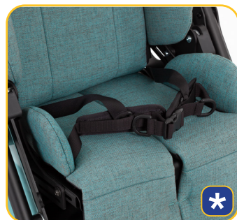
4-point Lap Belt