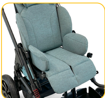
Hip Supports (required component)