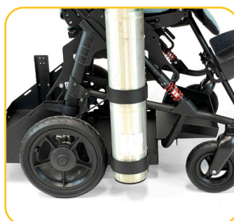
Oxygen Bottle Holder