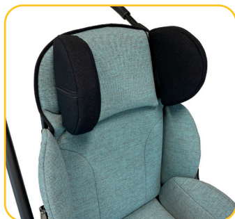
Highrise Headrest Pads