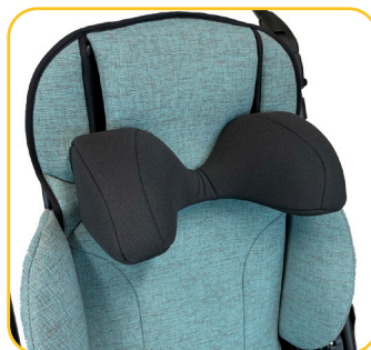
Anatomic Head Support