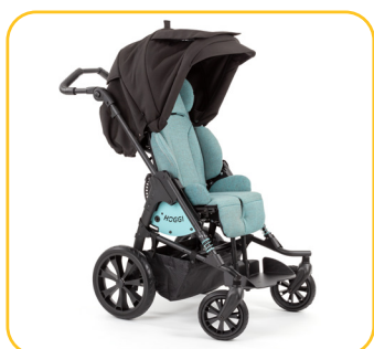
Canopy with Rain Cover