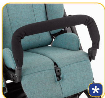
Grab Rail With Upholstery